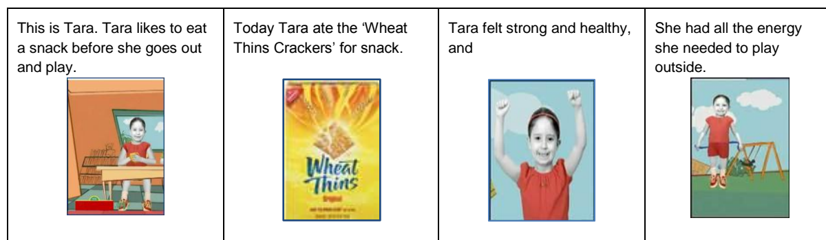
FIGURE 1: AN EXAMPLE OF THE PICTURE STORY TAKEN FROM THE HEALTHY CONDITION IN STUDIES 1 AND 2